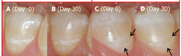
Figure 2: patient 1-003 - tooth 45 (Duraphat®, A-B) and tooth 35 (Curodont™ Repair, C-D); picture before (A,C) and 1 month (B,D) after treatment. Note that tooth 45 (control) shows further demineralisation whereas tooth 35 (test) shows remineralisation at D30 (B, D) compared to D0 (A, C).