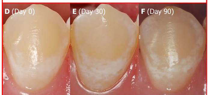
Figure 1: patient 1-013 - tooth 35 (Duraphat®, A-C) and tooth 34 (Curodont™ Repair, D-F); picture before (A,D), 1 month (B,E) and 3 months (C,F) after treatment. Note that tooth 35 (control) shows an increase in cavity's size and number and tooth 34 (test) remineralisation at D90 (C, F) compared to D0 (A, D).